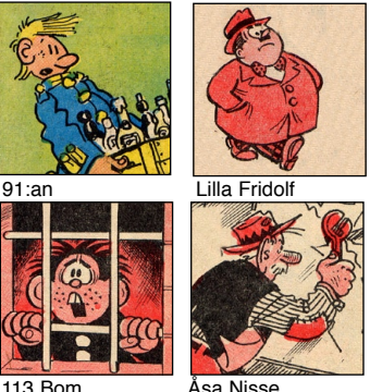
owned by a giant Swedish comic publisher. Semic Press. None of them were especially hip, but they were all there was. You might say 91:an at some point in his life... One bright spot, particularly in the '60s, was the Swedish edition of MAD, which was excellent.. In the '70s other foreign influences also began to find their way to Sweden: Crumb, Spiegelman,

from the '30s. One such was the poetry, short stories, illustrations, in the comic paper Larson. A army cartoon strip. 91:an from photos and experimental col-1932, which had its own paper. lages, all mixed together with Others included Åsa Nisse, 113 comic strips. New cartoonists Bom and a newcomer Lilla Fridolf appeared from nowhere. Soon, from 1956. All the cartoons were Galago had created a completely